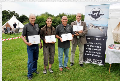
UKCSV Breed Show