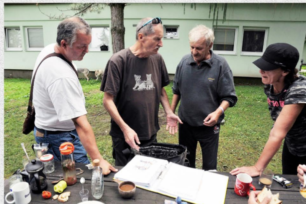
Summer Camp (Orava Gacel)