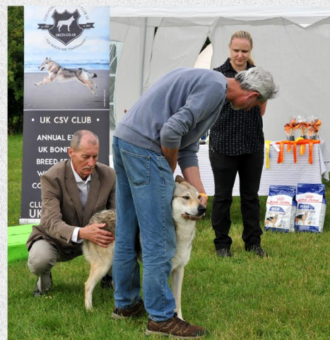
Bonitation - UKCSV