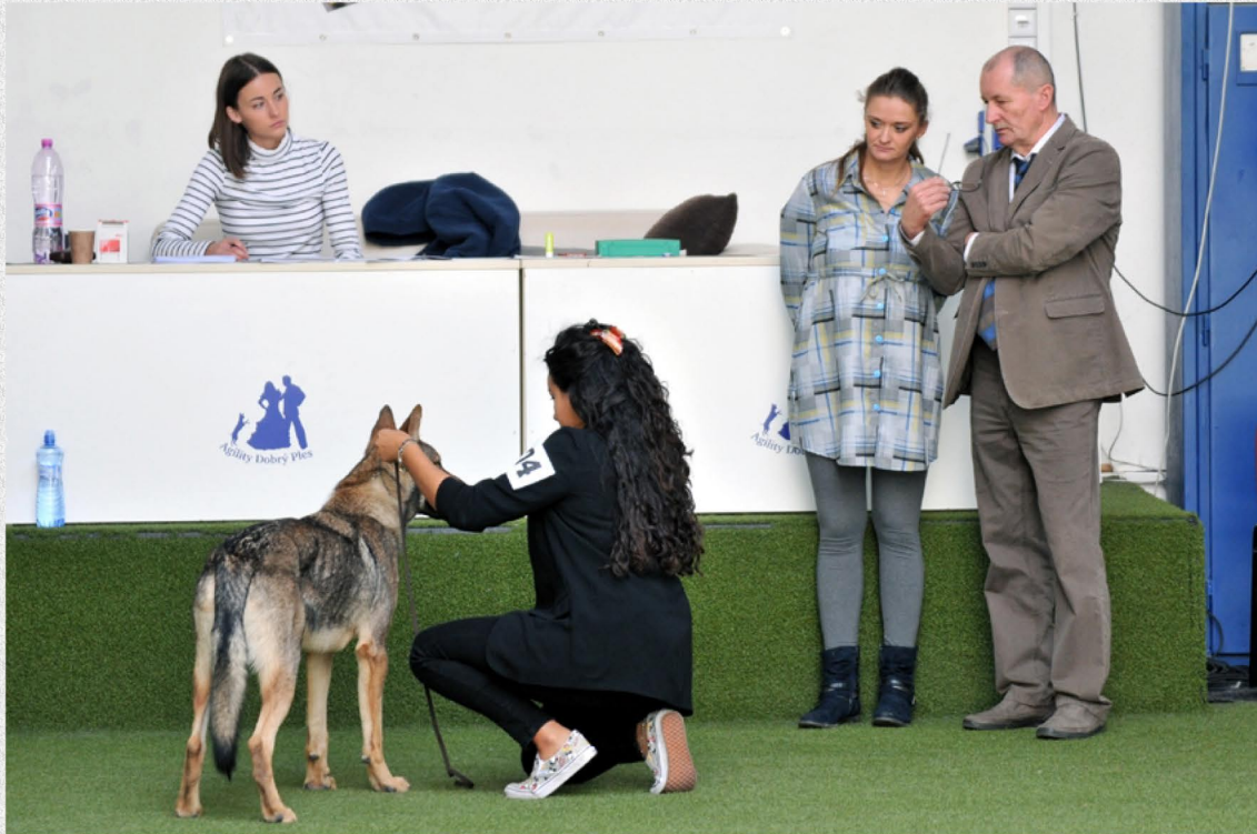
European Exhibition

"Although I served as president in both of my club positions, I must emphasise that I have always been a 'worker' who worked hard. Although I managed the entire committee and club, I always accepted and put into practice all reasonable proposals of its members, which benefited the development of breeding."