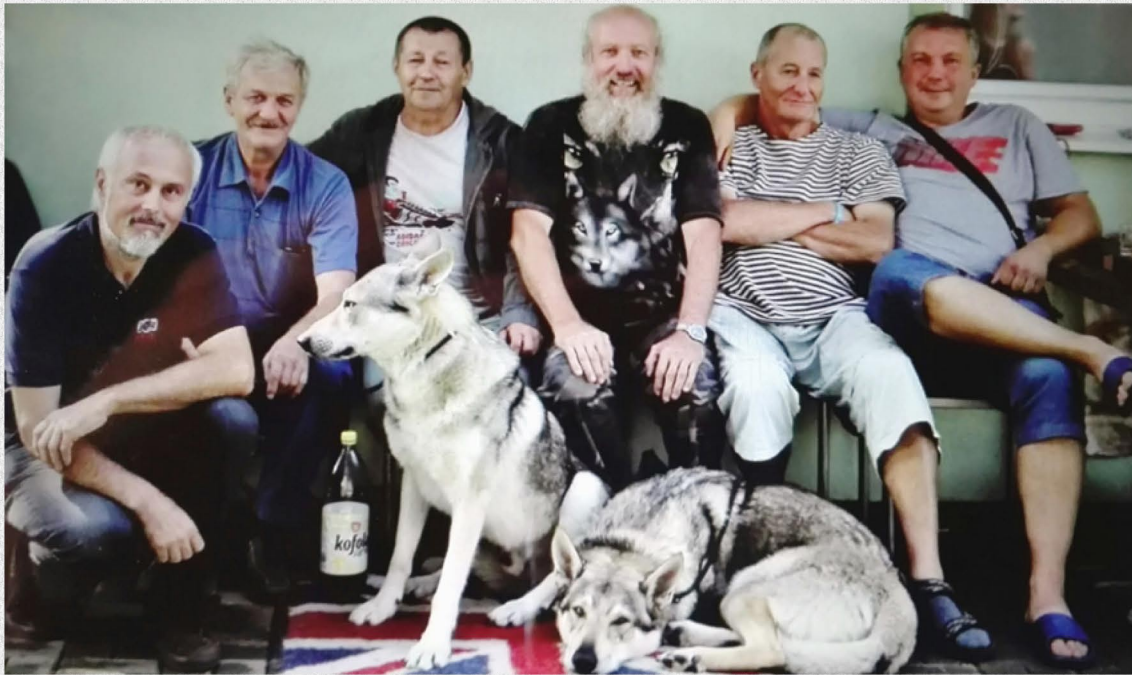
Summer Camp (Orava Gacel)