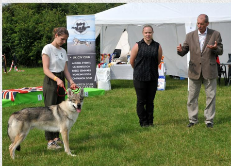
UKCSV Breed Seminar